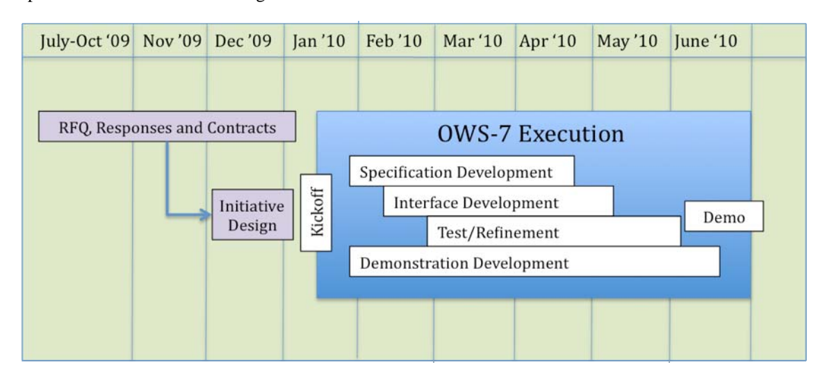
Figure 2 – Notional Schedule for OWS-7

This section defines an initial concept for the conduct of development activities in OWS-7 RFQ. Figure 2 lays out a notional schedule for the OWS-7 Initiative. The actual schedule and further information will be provided at the Kickoff meeting.