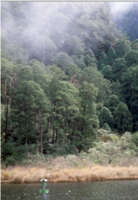
Figure 3: A wirelessly-connected buoy provides real-time data.