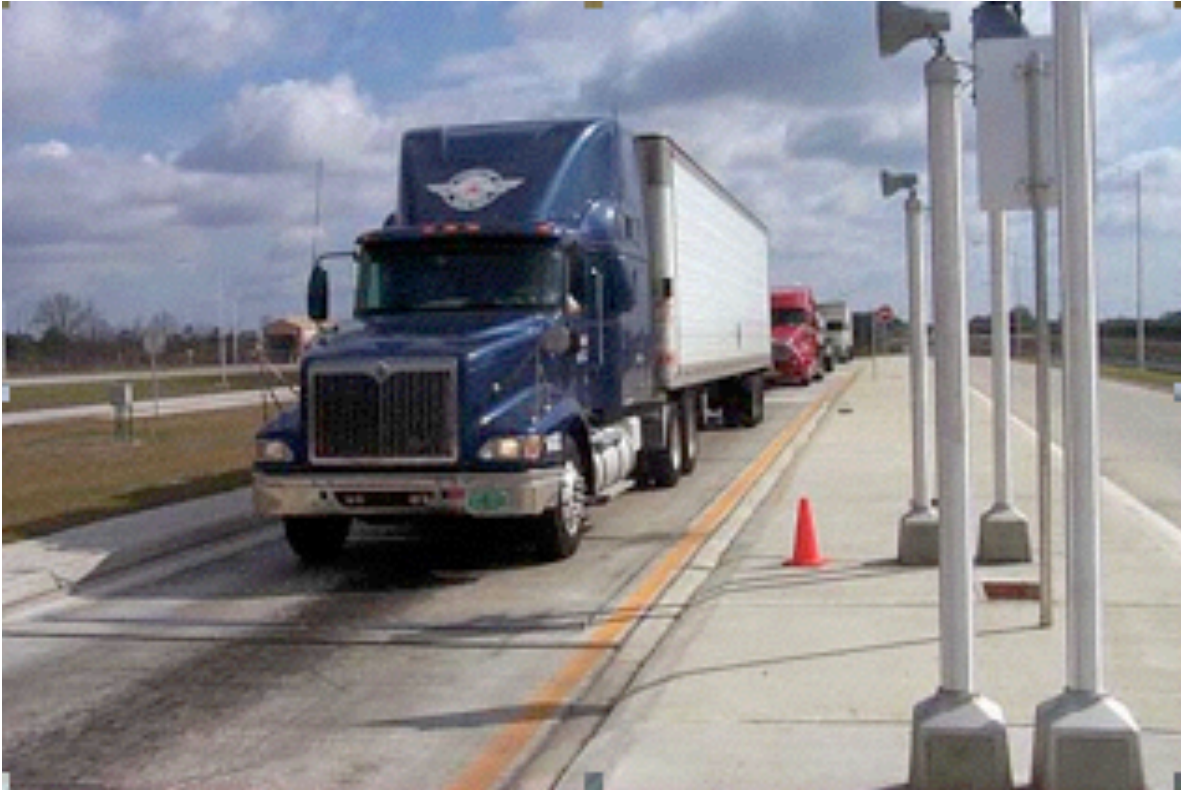
Figure 6: One ORNL application involves chemical and radiation sensors at truck weigh stations.

The ORNL approach takes advantage of the consistency built into the OGC's suite of specifications. The developers have embedded SWE encodings into application schemas that implement the OGC's OpenGIS Geography Markup Language (GML) Encoding Specification and OpenGIS Web Feature Service (WFS) Implementation Specification. Implemented in this way, each observation is a feature.